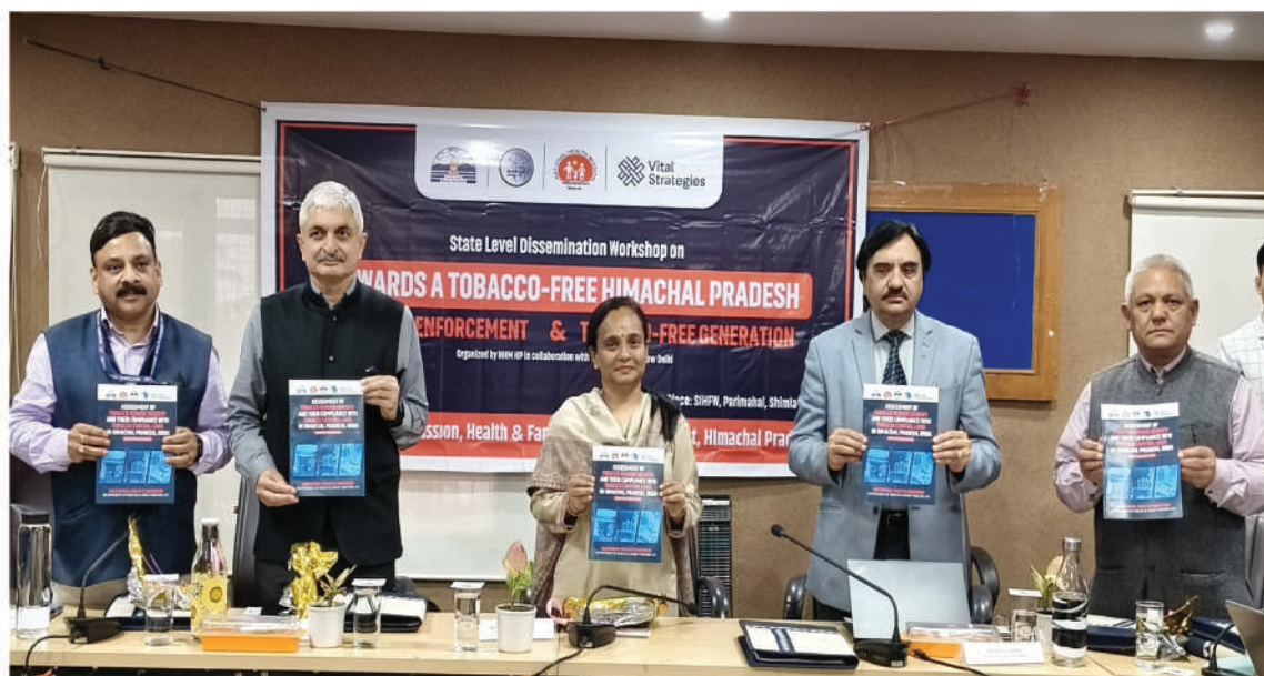
Launch of Baseline Assessment Survey on Tobacco Vendor Density and compliance with Tobacco Control Laws in Himachal Pradesh